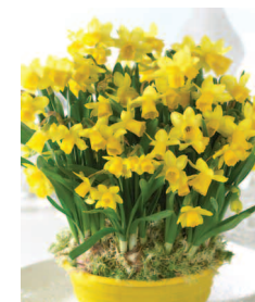
Narcissus 'Tête à Tête'