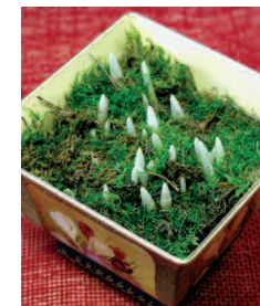
Crocus pot with bulbs sprouting - and in full bloom.

NOTE: containers may vary from illustrations.