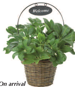
On arrival (basket not included)

'Snow Frills' is a brand new variety with exquisite double blooms that start off apple green then fade to yellow before turning pure white.