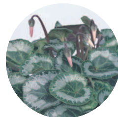
Before - all cyclamen