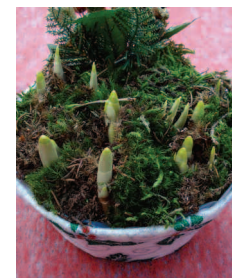
All narcissi on arrival