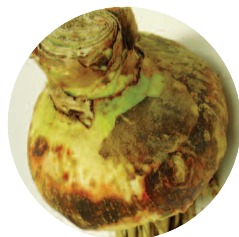
Supplied as a dry bulb

Remove spent flowers but leave the bulb in its pot on a windowsill where it will receive plenty of light during spring and summer. Water when the compost surface dries out and add liquid fertiliser once a month. In early autumn, move to a cooler location and stop watering. The leaves will turn brown and can be removed with sharp secateurs. After a few weeks of dormancy, bring into warmer conditions and commence watering. Soak the compost and let the surface start to dry before watering again. A bud should start to appear. Re-pot every two years following the instructions above, either when the plant is in full growth or just before coaxing the dormant bulb back into growth.