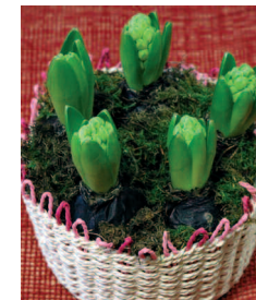
Hyacinths on arrival. Baskets and colours will vary.