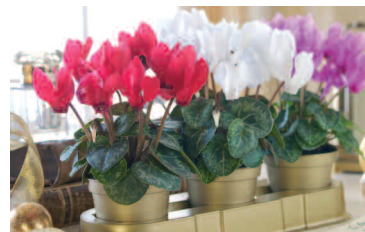
Mini Cyclamen in a gold bar

Your plant will have arrived with buds just poking through the foliage. Place in a position of bright, indirect light in a consistently moderate temperature and try to avoid placing near radiators and draughts. A common failure with cyclamen is that the compost is either too dry or too wet. Water from the base if possible and always allow the compost to dry out between waterings. Flaggng foliage is usually a sign of over-watering. To check if your cyclamen needs water, lift the plant. If it feels very light in its pot then it needs water. Feed with low-nitrogen liquid fertiliser every two weeks. As the flowers begin to fade, gently pull the stem from the base of the plant and remove the whole stalk from the corm. This will encourage new flowers. A few small stones in the bottom of the pot will ensure that the cyclamen does not stand in water. If your plant is supplied with a silk pot cover, please remove this before