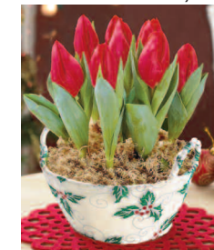
Tulip basket in bloom